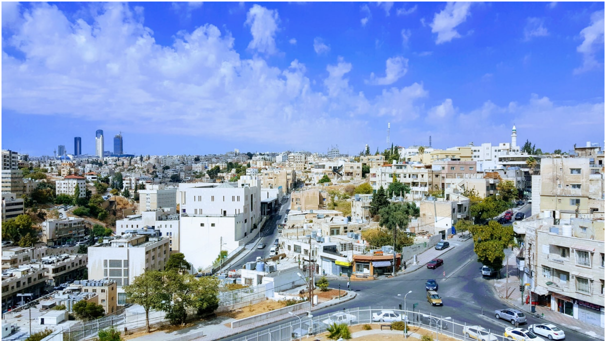
View from the Citadel, Amman, Jordan