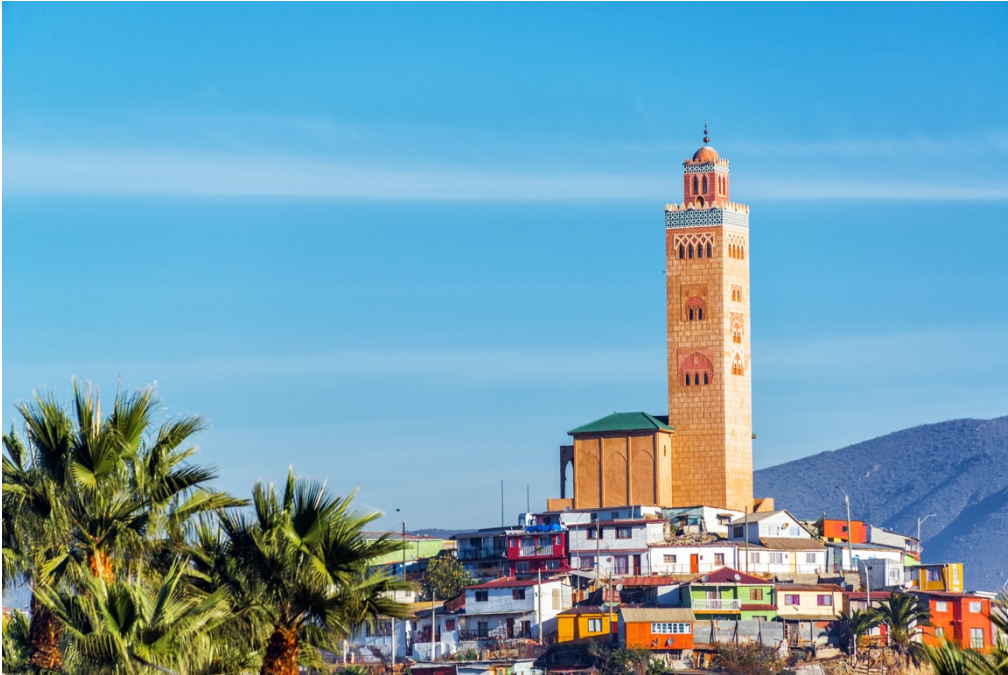
Centro Mohammad IV Mosque, Coquimbo, Chile, South America